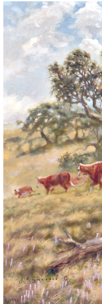
“Fall Gather, California” 48” x 32” oil