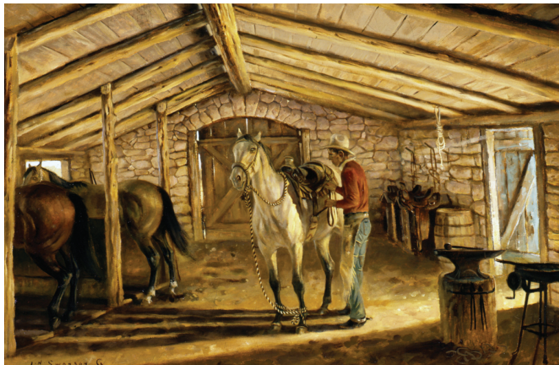
"Saddling in the Stone Barn" 40" x 30" oil

Printed in U.S.A. by Casey Printing, King City, California. Case bound with dust jacket. 240 pages, 13"x10". Available from www.jnswanson.com