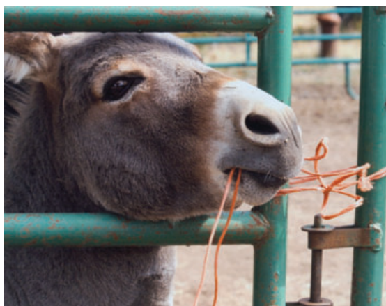
“The Great Escape” Debbie Borches, Newport, Washington