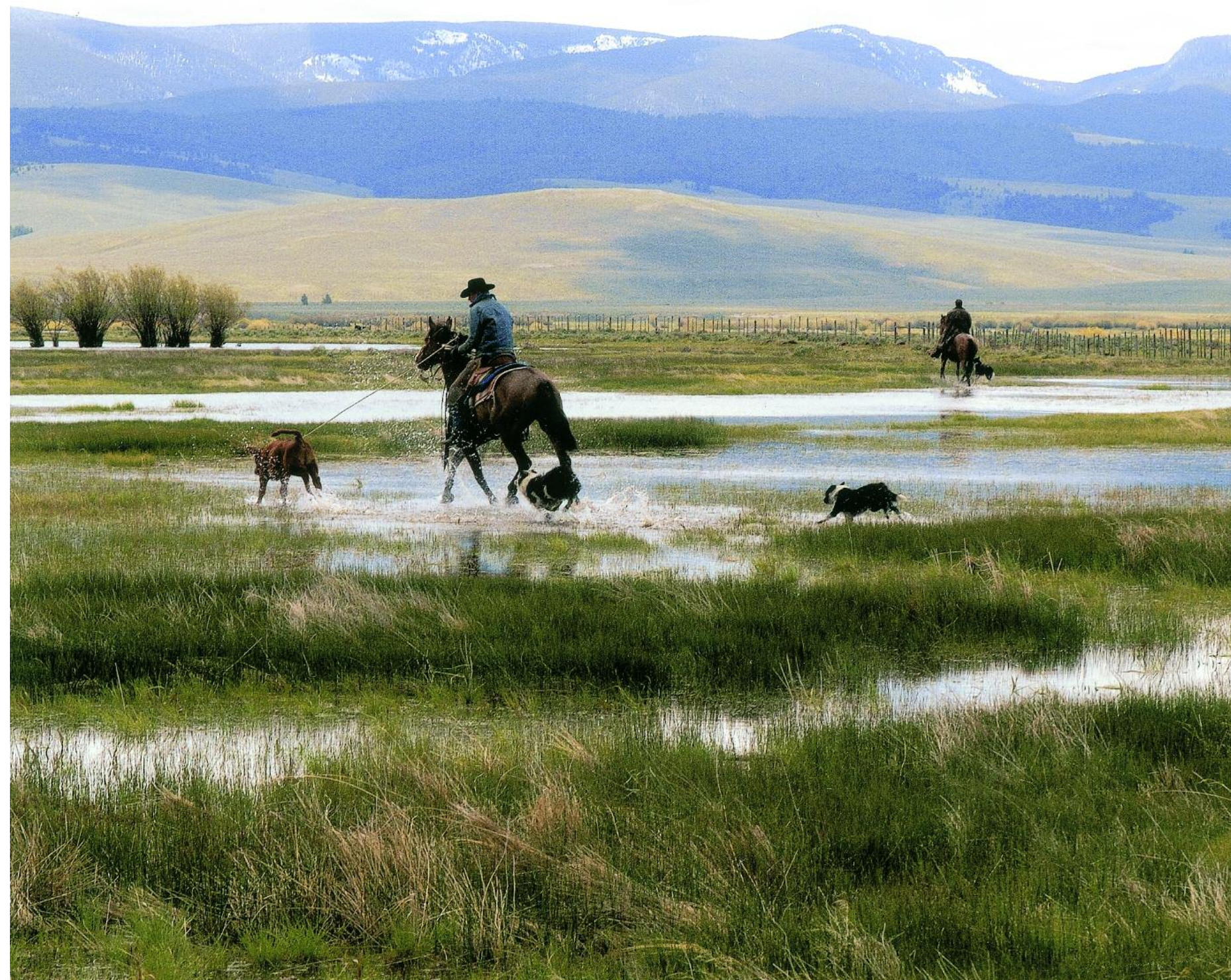
On a bleak winter day, there is nothing harder to drive than a single calf through icy water. It takes two cowboys on horseback and four dogs to do the job. Beaverhead County, Mont.

Chilled to the bone . It's so cold your lips won't work, but you keep pressing forward one frozen step at a time. Knowing you are the link between life and death for the stock is the only thing that keeps you going on those endless gray days and even longer black nights.