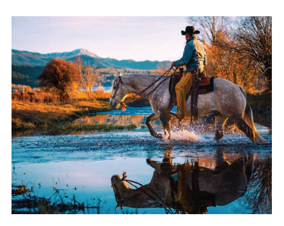
6th Place: "The Last Day"

It is a cold and rainy October day in southwest Wyoming and the freshly tagged ewes graze near camp while horse and dog wait for a job. Tagging is shearing the face and tail of the sheep.