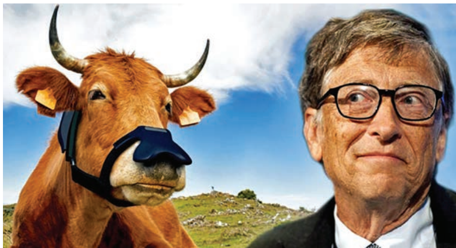
BILL GATES WITH A MASKED COW TO OMBAT CLIMATE CHANGE VIA INTERNET