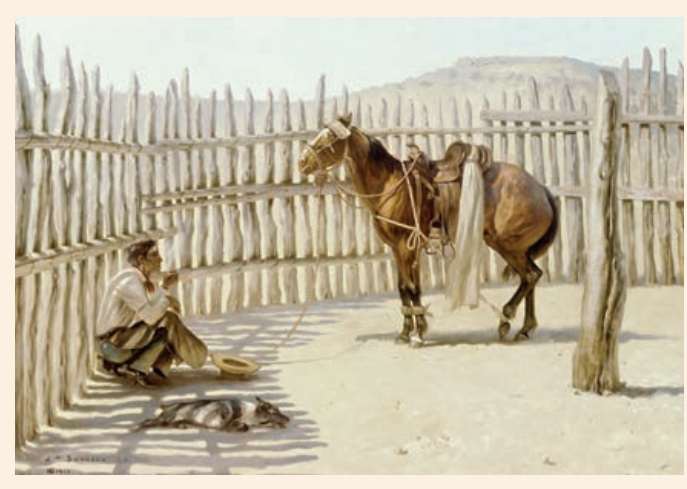
"Time to Think"