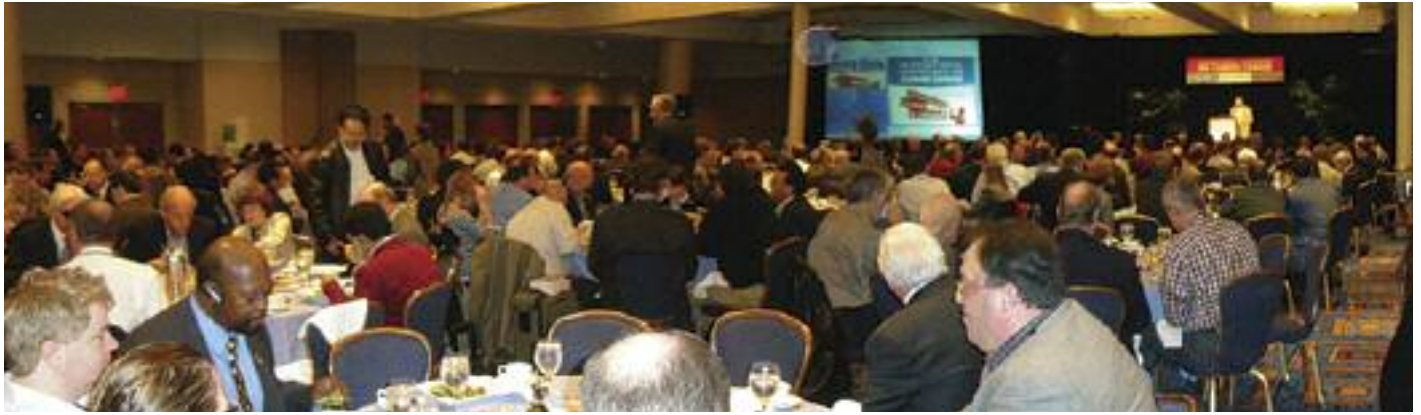
The 2008 International Conference on Climate Change in New York City was attended by more than 500 people, including 100 leading scientists in the field.