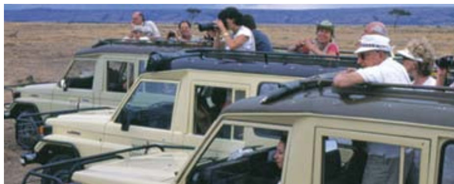
In 1962, there were 1,000 official protected areas worldwide. Today there are 108,000, with more being added daily. The total area of land now under conservation protection has doubled since 1990, when the World Parks Commission set a goal of protecting 10 percent of the planet's surface. That goal has been exceeded, as over 12 percent of all land—a total area of 11.75 million square miles—is now under conservation protection. Environmentalists, especially Europeans and Americans, love the wildlife safaris and the "protection."

The true worldwide figure, if it were ever known, would depend on the semantics of words like "eviction," "displacement" and "refugee," over which parties on all sides of the issue argue endlessly. Regardless of which estimate or definition is chosen the larger point is that conservation refugees exist on every continent but Antarctica, and by most accounts live far more difficult lives than they once did, banished from lands they thrived on, often, like the Maasai, for thousands of years, in ways that conservationists who supported the displacements have since admitted