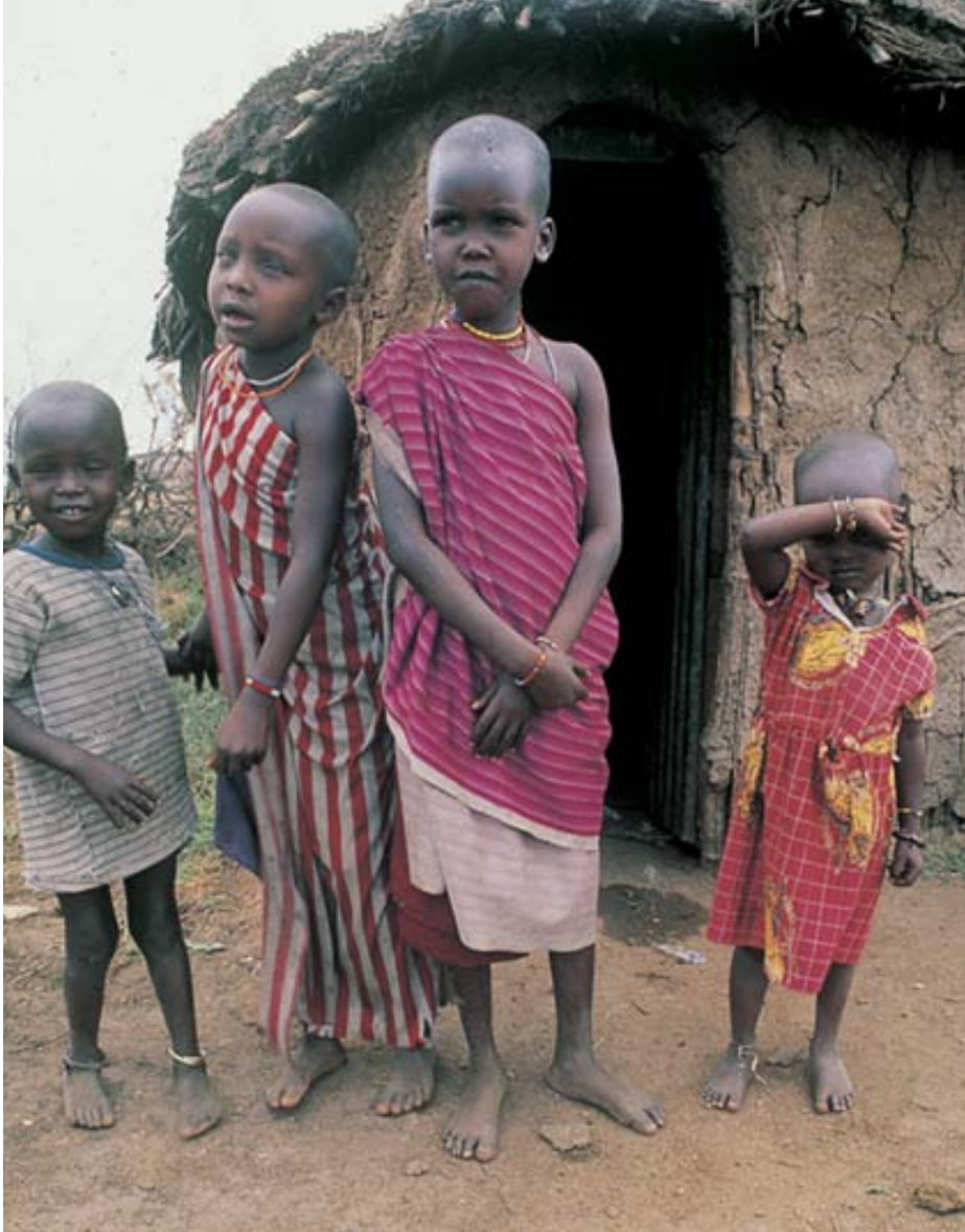
Three of these children are suffering from river blindness, a condition that could be cured with cleaner water. The tallest girl in the middle leads the others. “We recognize that indigenous people have perhaps the deepest understanding of the earth’s living resources,” concedes Conservation International’s chairman and CEO Peter Seligman, and “our planet’s ecological health is inextricably linked to human health, security and ability to prosper. Conservation simply cannot be achieved without full recognition of this basic truth.... We firmly believe that indigenous people must have ownership, control and title of their lands.” So why don’t they?

land) or similar financial incentive provided by the Global Environmental Facility and one or more of its eight “executing agencies” (bilateral and multilateral banks), combined with an offer made by the funding organization to pay for the management of the park or reserve. Broad rules for human use and habitation of the protected area are set and enforced by the host nation, often following the advice and counsel of a BINGO, which might even be given management powers over the area. It’s a system that too often leaves local people entirely out of the process.