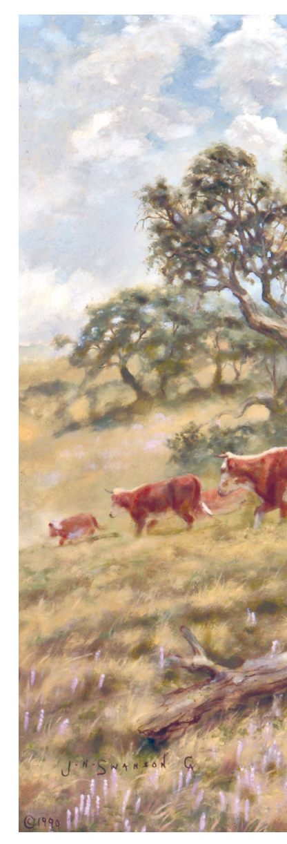
"Fall Gather, California" 48" x 32" oil