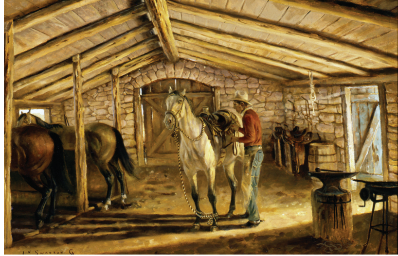
"Saddling in the Stone Barn" 40" x 30" oil

Printed in U.S.A. by Casey Printing, King City, California. Case bound with dust jacket. 240 pages, 13"x10". Available from www.jnswanson.com