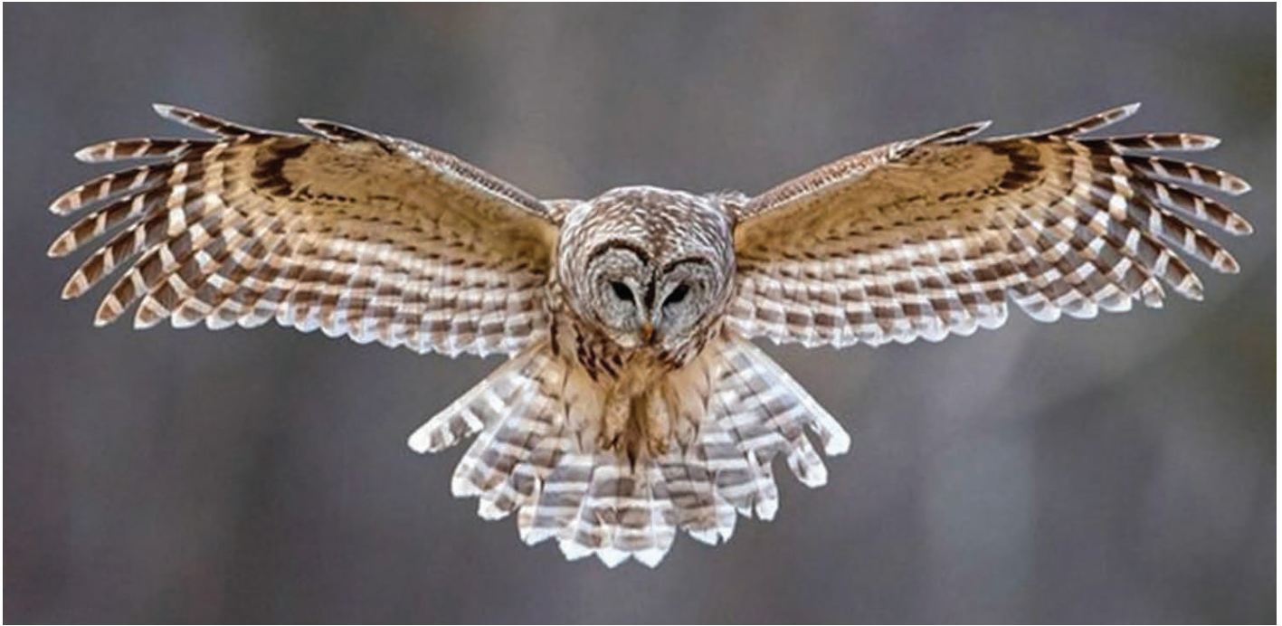
ABOVE: Barred owls prey on and interbreed with smaller northern spotted owls. To “save” spotted owls, the federal government plans to shoot 500,000 barred owls over the next 30 years. BELOW: Oregon millworkers understood early that the spotted owl was a surrogate for “saving” old-growth forests. Government refusal to manage old growth has led to the loss of one million acres to wildfire since the 1990 listing. OPPOSITE TOP: Wildlife biologists use dead mice to lure northern spotted owls into their gloved hands. The owl was federally listed as a threatened species in 1990. OPPOSITE BOTTOM: An Oregon millworker protesting the politicization of the Endangered Species Act at a Salem rally in 1990.

have occurred—or would have been much less destructive—had the Forest Service been allowed to initiate some innovative adaptive management prescriptions on those 24.5 million acres.