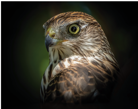
“Hawkeye” Once thought averse to towns and cities, Cooper’s hawks are now fairly common urban and suburban birds. Some studies show their numbers are actually higher in towns than in their natural habitat—forests. This portrait is from Grand Junction, Colorado.