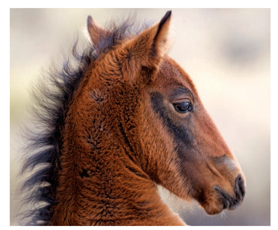
Mane event. Wild colt rears up, Virginia highlands, Storey County, Nevada.