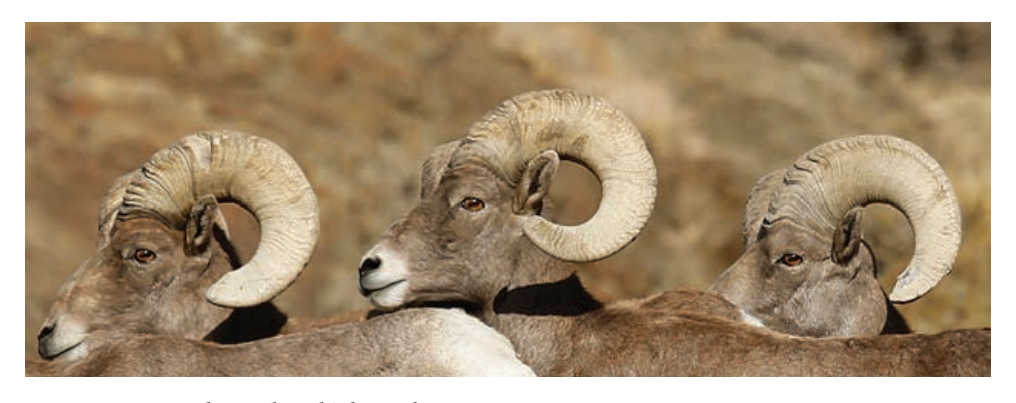
Tres Hombres. Three bighorn sheep on Clan Alpine Ridge east of Fallon, Nevada.

Waiting for the mail. A letter carrier finds surprise visitors near Otto, Wyoming.