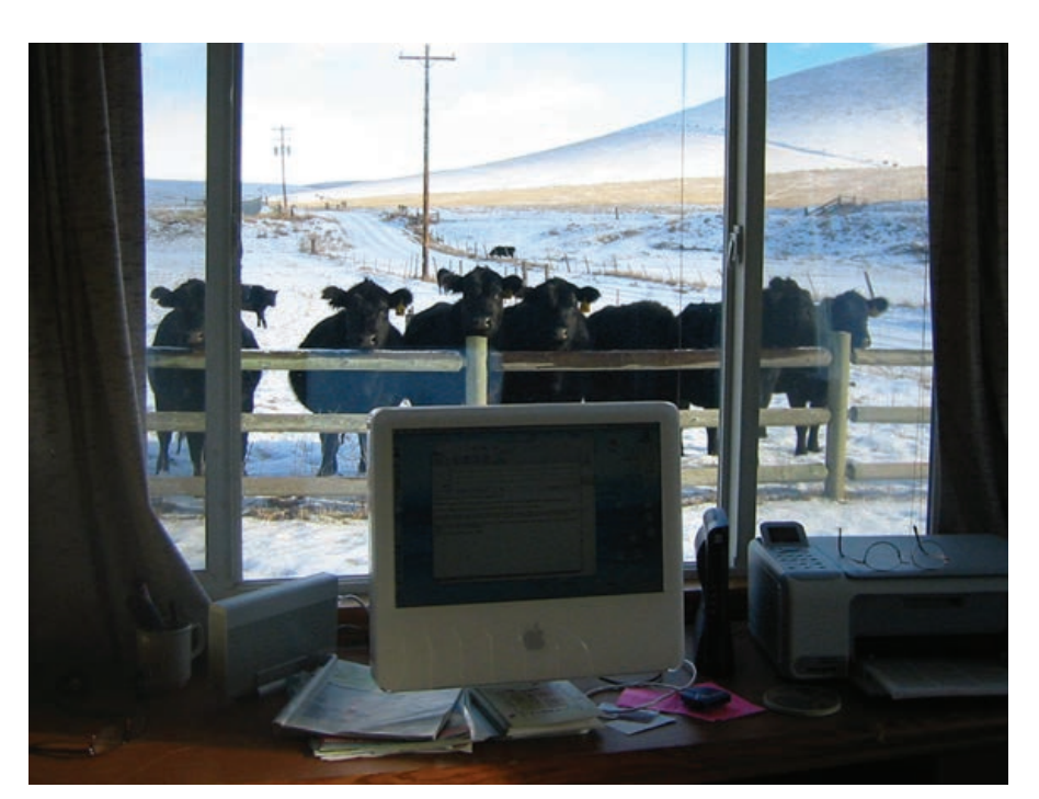
www.cowsingles.com. Modern technology seems to encompass all beings. Doing morning emails, I saw these heifers watching me watch them at the Wade Angus Ranch, Lostine, Oregon.