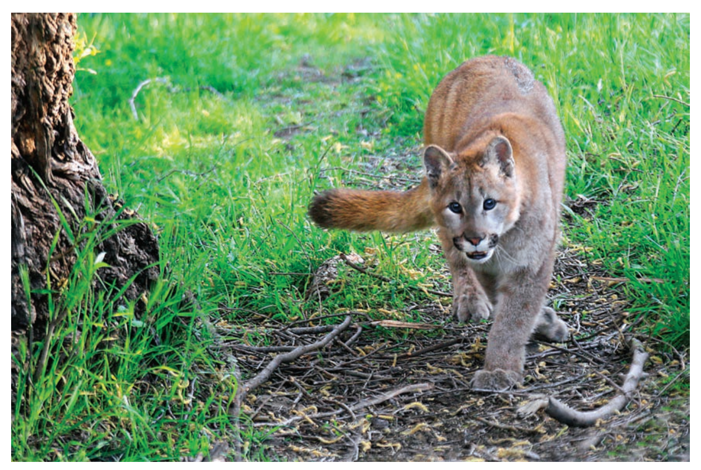
Protective mother cougar tells me not to get any closer near Toquerville, Utah.