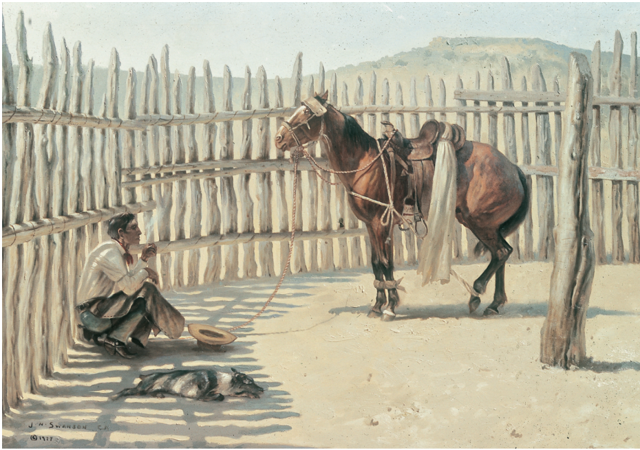
"Time to Think"

NEWS FLASH! See page 86 to read about Jack's book, "The Life & Times of a Western Artist." It includes more than 100 paintings, plus photos and stories.