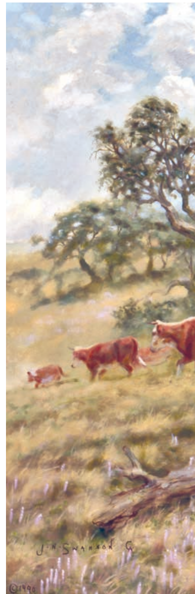
“Fall Gather, California” 48 x 32” oil