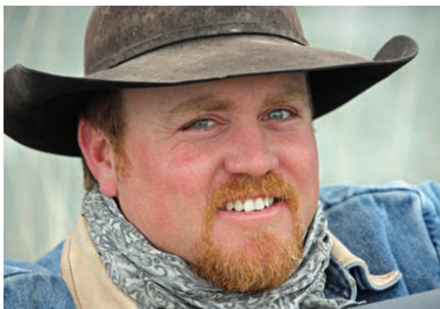
“LAST CHANCE” BLM horse gather in White Pine County.