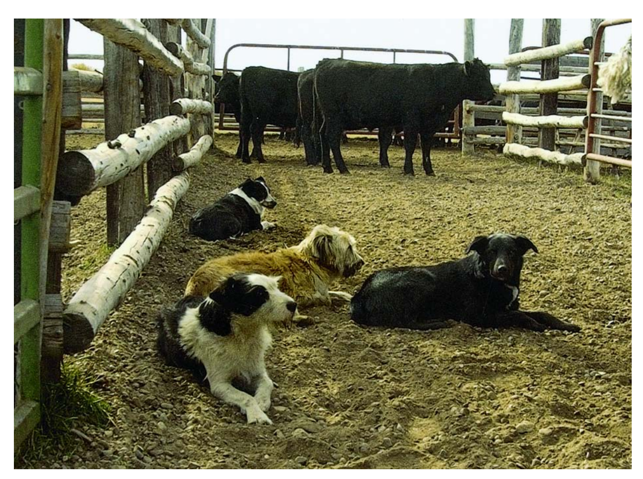
"What next?" Fred Hirschy's dogs lie in the sorting pen, waiting for the next command. Strowbridge Ranch, Wisdom, Mont.

Both horses and dogs are vital members of a cowboy's team. Moving 800 head of cattle 10 miles can be a grueling trip without dogs. The thicker the willows, the more essential the dogs are for keeping the cattle together and keeping them moving.