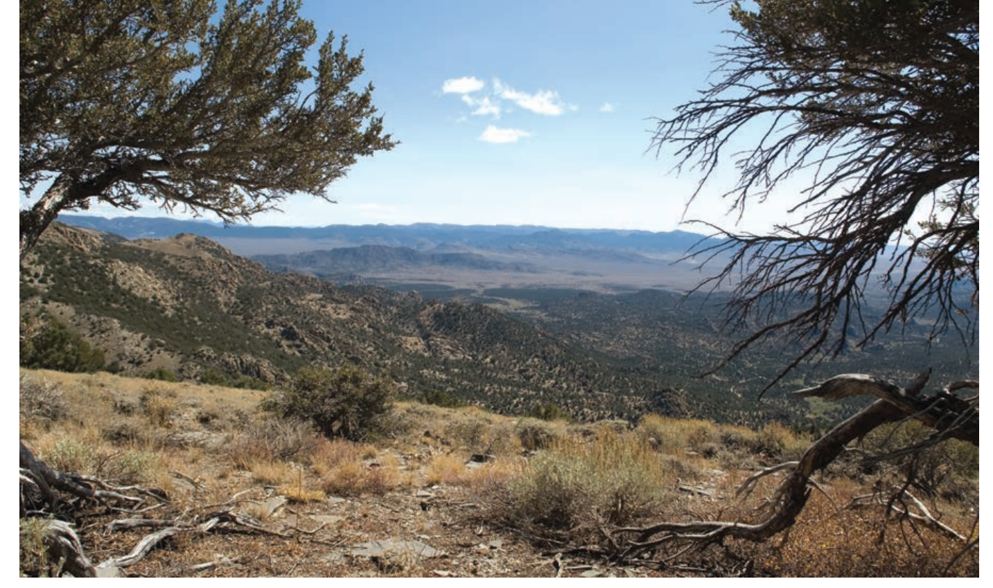
The northern winter range in the Ralston Valley viewed from the Silver Creek drainage. Historically, this country also ran a lot of sheep.

employees. He ordered a civil show-cause hearing for the last week of August.