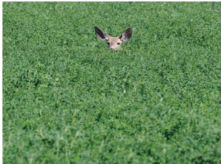
A doe rests (and eats) in a sea of alfalfa on the east side of Washoe Lake in August 2017. A large herd of mule deer has made this Nevada field its home.