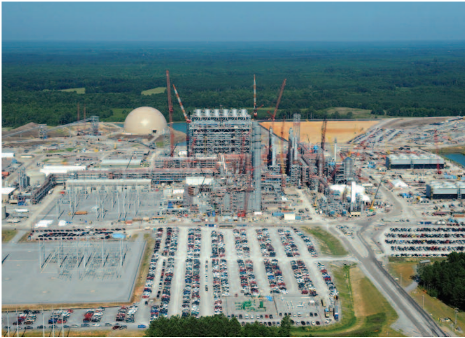
Kemper County Project (EPA's "Kill Coal" Plan). This project is one of four demonstration coal-fired CO 2 sequestration plants under construction. Owned by Southern Company, the company received a $270 million grant from the Department of Energy. Southern Company has issued a statement saying the Kemper technology "cannot be consistently replicated on a national scale." The EPA claims it can be commercially built and operated competitively. Who do you believe? Photo taken in September 2013. Completion expected in late 2014.

McCarthy's "regulate everything" disconnect from reality justifies any action by the EPA to stop any perceived pollution or damage to the environment, no matter who is hurt or how high the cost. McCarthy has granted herself the authority to do it, the Constitution be damned. She is so convinced of her righteous position that she demanded, "Can we stop talking about environmental regulations killing jobs, please?" when addressing Harvard Law School on July 31 last year. "We need to embrace cutting-edge technology as a way to spark business innovation." Like many bureaucrats, McCarthy seems to live in an alternate universe. Dozens of independent analyses like the Heritage example earlier clearly show that EPA regulations kill jobs and cost billions of dollars.