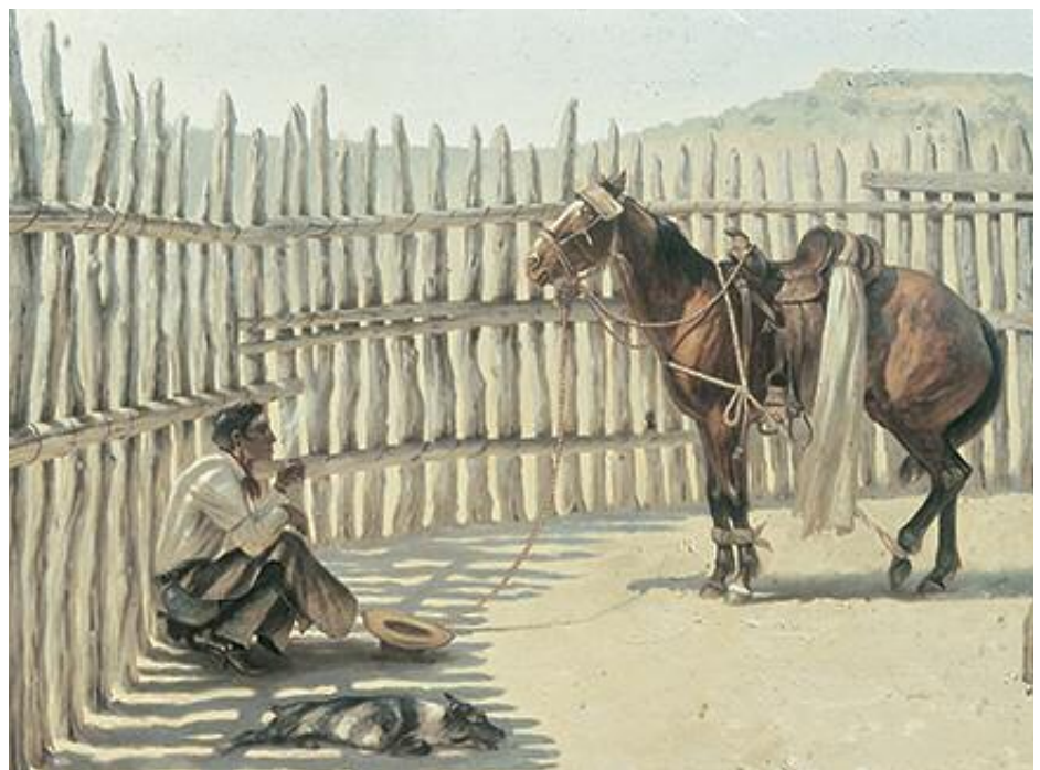
"Time to Think" © J.N. Swanson

Choose from any of these images or collect all four. Allow four weeks for delivery.