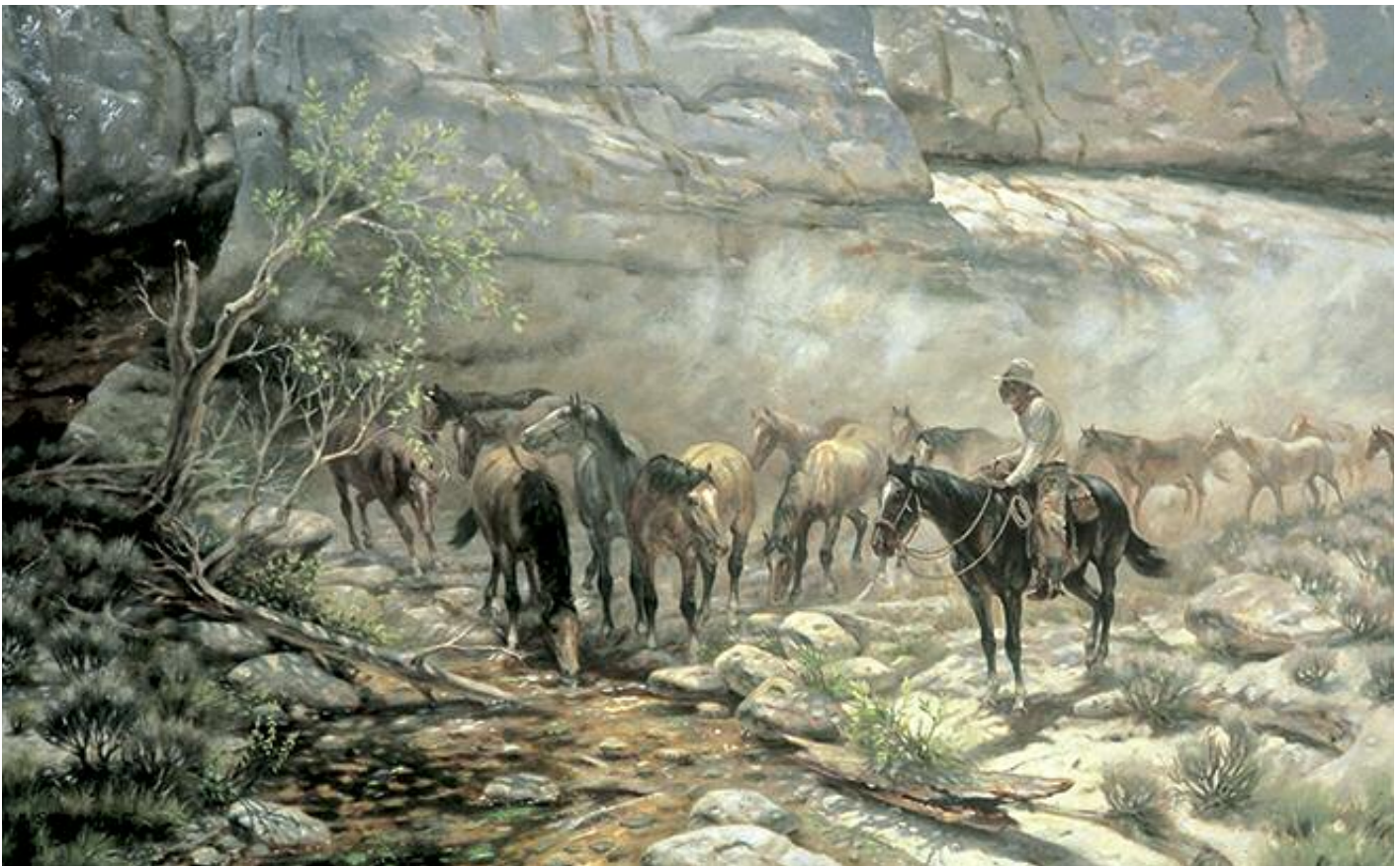
"Watering the Remuda" Original owned by great cowboy actor Sam Elliott.