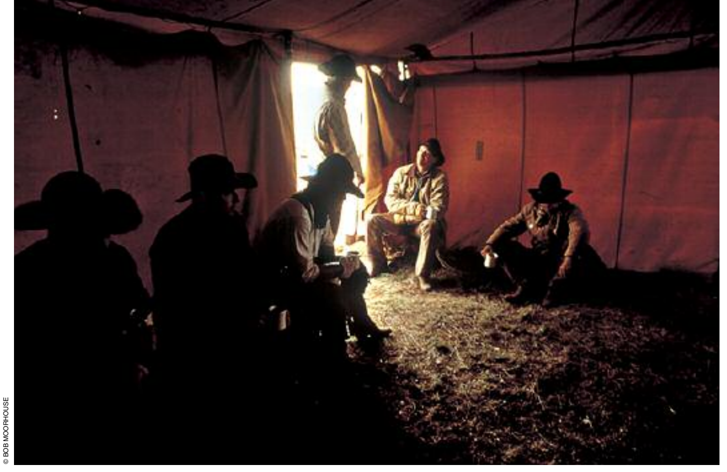
Pitchfork Ranch, West Texas. When the cowboys go out with the wagon they live in teepees and congregate in big tents for chuck and coffee-time. If they get lucky enough to win some Working Ranch Cowboys Association events, they might make it to the finals in Amarillo, Texas in November.

than $160,000 has been distributed through the crisis fund to injured or ill cowboys or their family members for medical bills. An additional $82,000 has been given through the scholarship fund to students from ranch families to help pay college costs for the veterinarians and ranch managers of tomorrow.