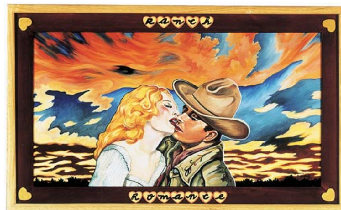
"Ranch Romance" (available as prints).