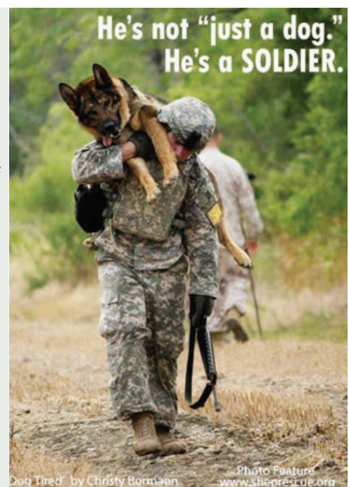
Dog Tired by Christy Bormann Photo Feature www.sheprescue.org