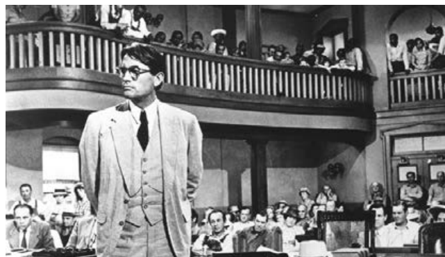
Gregory Peck played Atticus Finch in “To Kill a Mockingbird.” This country lawyer in the segregated South was defending Tom Robinson, an innocent black man played by Brock Peters.