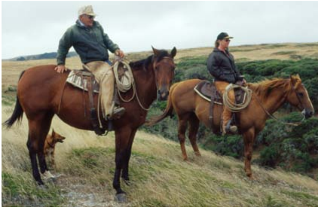
The ink was hardly dry on the sale agreement when powerful forces were already moving to force the government to renege on it. By 1998, battered, bullied, and badgered by a tagteam of agencies and environmental groups, the Vails agreed to cease ranch operations and get their cattle off the island. New Park Service staffers claimed the ranch was "irreparably damaging" park resources but "no facts or proof could be offered by park staff; they just provided emotional arguments."

After the sale was complete all was well, observes Setnicka, until 1990. At that point a superintendent who had opposed actions toward the early removal of the Vails was transferred, and the park's budget was increased by $900,000: "The park had to do something to spend the money," writes Setnicka, so it hired a number of new staffers who came to the conclusion that the ranch's operations were "irreparably damaging" park