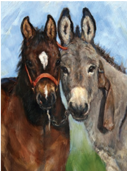
Burro with foal.