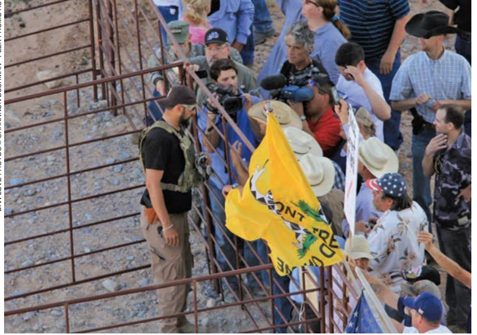
Dressed in body armor, supervising Special Agent Dan Love talks to members of the press and locals who arrived at Cliven Bundy's ranch to protest the BLM's military-style raid and attempts to remove cattle. The cows were calving and temperatures were close to 100 degrees. It was a dangerous time to gather.