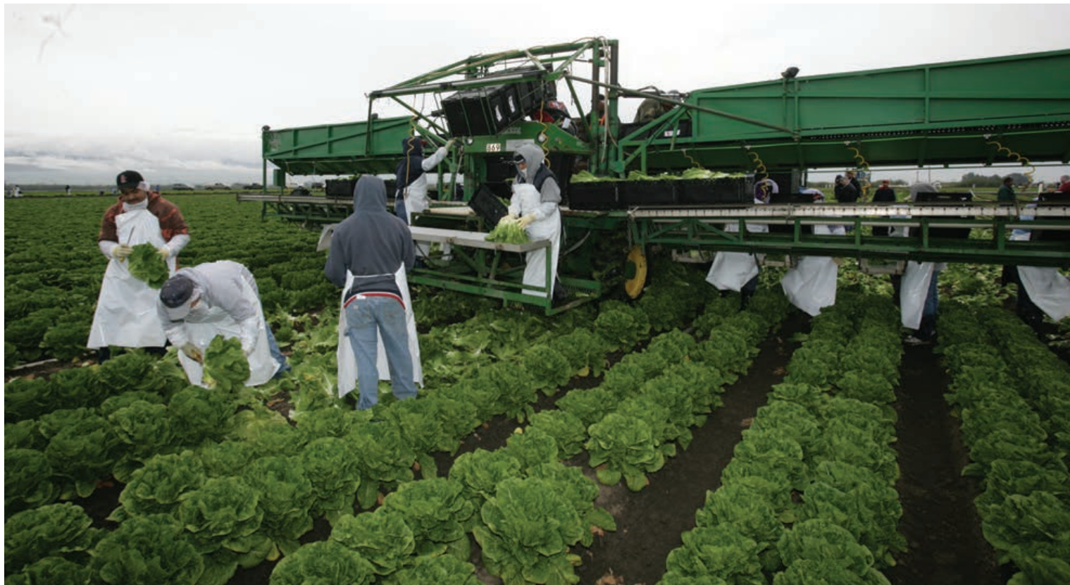
On an overcast day, a crew harvests lettuce in a field near Salinas.