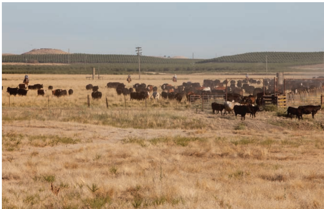
Bringing cattle in on the Circle Bar Ranch.