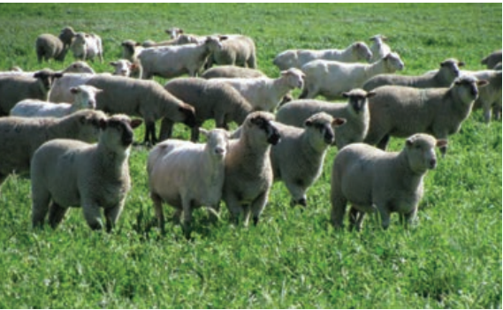
LEFT: Happy ewes just shorn, with market-ready California spring lambs. RIGHT: John puts up a mobile electric fence in a weed-infested field in Lathrop.

The sheep not only clean up the vegetation, but they also compact the levees.