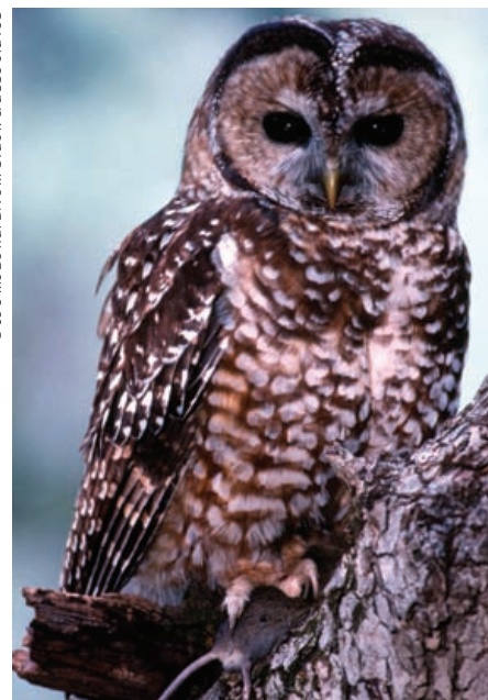
The spotted-owl controversy in the 1990s caused the eventual closing of hundreds of sawmills and the loss of tens of thousands of jobs.

President Obama is now considering three or more national monuments using the Antiquities Act containing over 13 million acres in 11 western states. He also directed the BLM in December 2010 to review 200 million acres of its land for inclusion into what is called “wildlands.” (See “Where the Wild Lands Are” by Dave Skinner, Summer 2011.) The problem with national monuments and wildlands is that it is a backdoor way to lock up federal lands from use. Clinton’s designation of the Grand Staircase-Escalante National Monument locked up the