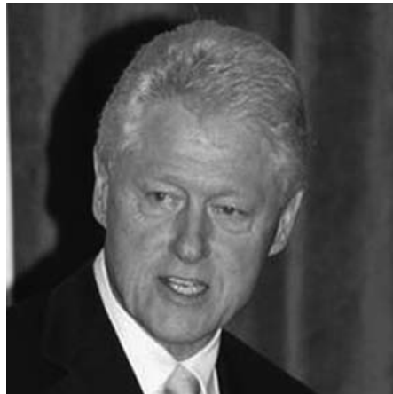
Bill Clinton stopped real production in Utah.

Since the early 1970s, there has been a well-orchestrated plan to implement "ecospiritual" management of the environment through coordination between federal land-based agencies like the FS and BLM, U.N. agencies, and environmental groups (aka NGOs or nongovernment organizations).