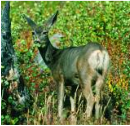
Mule deer feeds in burn area in Grand Teton National Park. Note new growth, fall 1988.

Fifth, the government needs a prospectus, just like any other suitor looking for investment capital: a series of reports that quantify and qualify the restoration work to be done over the next few decades on a forest-by-forest basis. No such documents exist. I tried for three years—unsuccessfully—to find funding for a comprehensive biomass study for Montana. The last such report was completed in