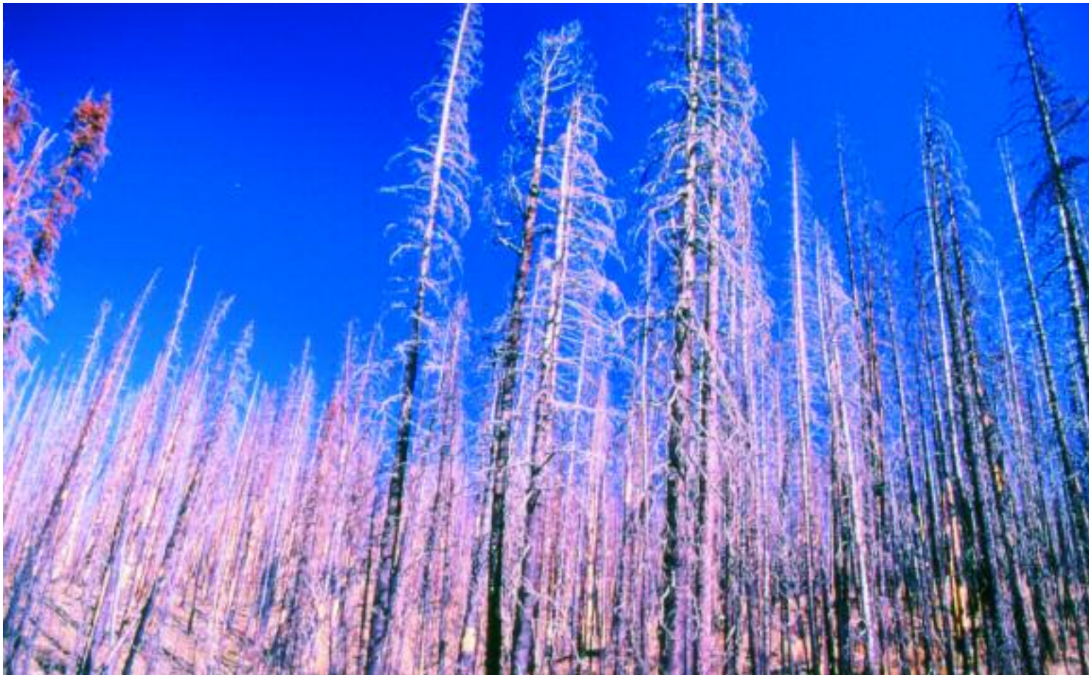
This photo of the devastating aftermath of a 2001 wildfire in northern New Mexico shows just how thick the Southwest’s forests have become over the last half-century. Whether thinning would have prevented this is impossible to say, but the damage most certainly would have been less severe than this total loss. In some areas, stand density is now a hundred times greater than it was a century ago—an unintended consequence of the nation’s long-standing policy of excluding wildfire from forests the public values for its timber, recreation potential, wildlife habitat and watershed.