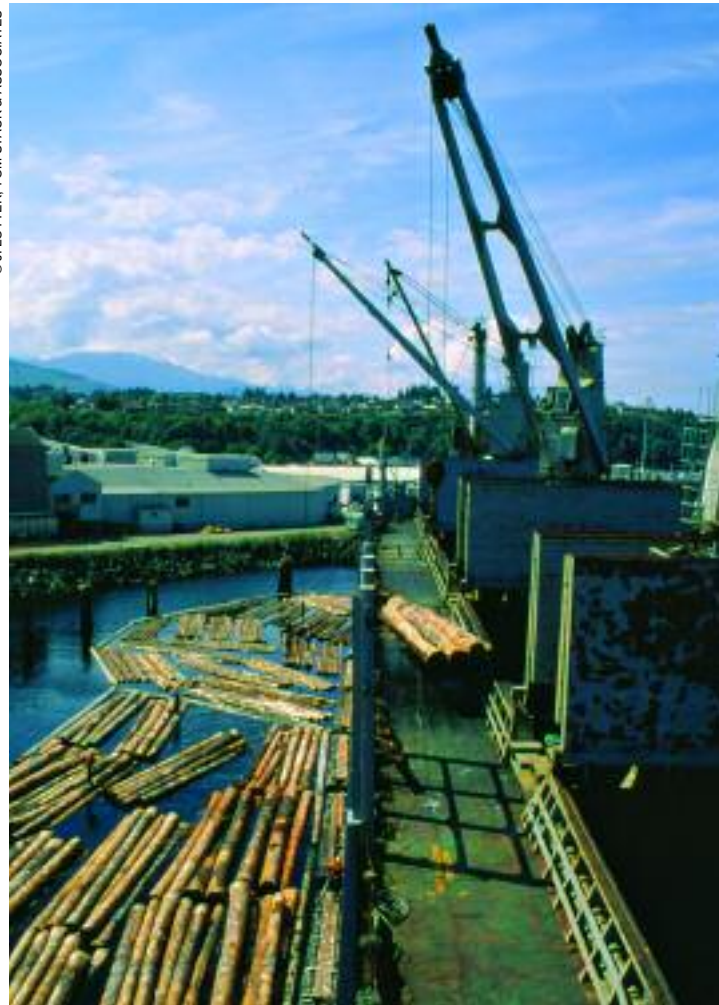
Foreign cargo ships loading U.S. timber for export in 1991. Now we are importing Canadian and other foreign timber, even though our own national forests are growing billions of board feet of timber each year. Instead of being used, it's taken by bugs or fire.

Fourth, replicate success. Of all the forest restoration projects I've seen, the most successful by far is the Clearwater Stewardship Project near Seeley Lake, Mont. There are six reasons for its extraordinary success, and not surprisingly all the reasons are people: a competent and enlightened district ranger; a very supportive forest supervisor;