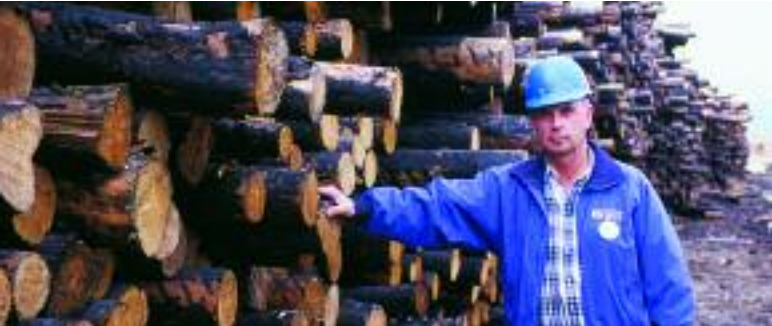
JIM HURST © JIM PETERSEN

The news blasted all over the local and regional papers in April 2005. It even made it into USA Today . The Owens and Hurst sawmill is closing. For good. In four months. Appropriate people expressed appropriate dismay—U.S. senators and representatives, state and local leaders. The Montana Wilderness Association and the Ecology