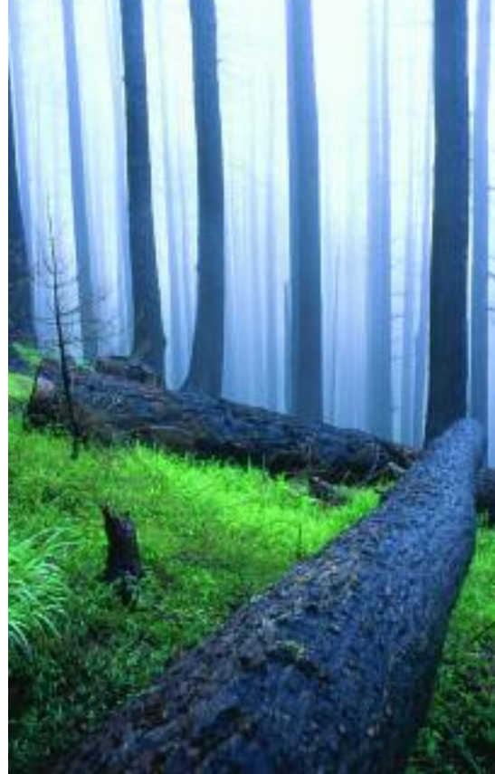
ABOVE: Little remains in the devastating aftermath of the 500,000-acre Biscuit Fire on southern Oregon's Siskiyou National Forest. Less than one percent of the commercial timber killed by the 2002 fire has been salvaged. The rest has been tied up in litigation or declared off-limits to salvage. BELOW: Planted Douglas fir seedlings, Port Gamble, Wash.

Fire has always been the main cause of forest destruction, or "disturbance" as ecologists