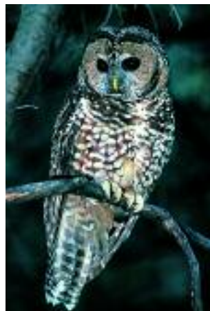
Saving spotted owls (above) may mean killing barred owls (p. 50).

words, in areas where some harvesting has occurred owl numbers are increasing a bit, or at least holding their own, while numbers are