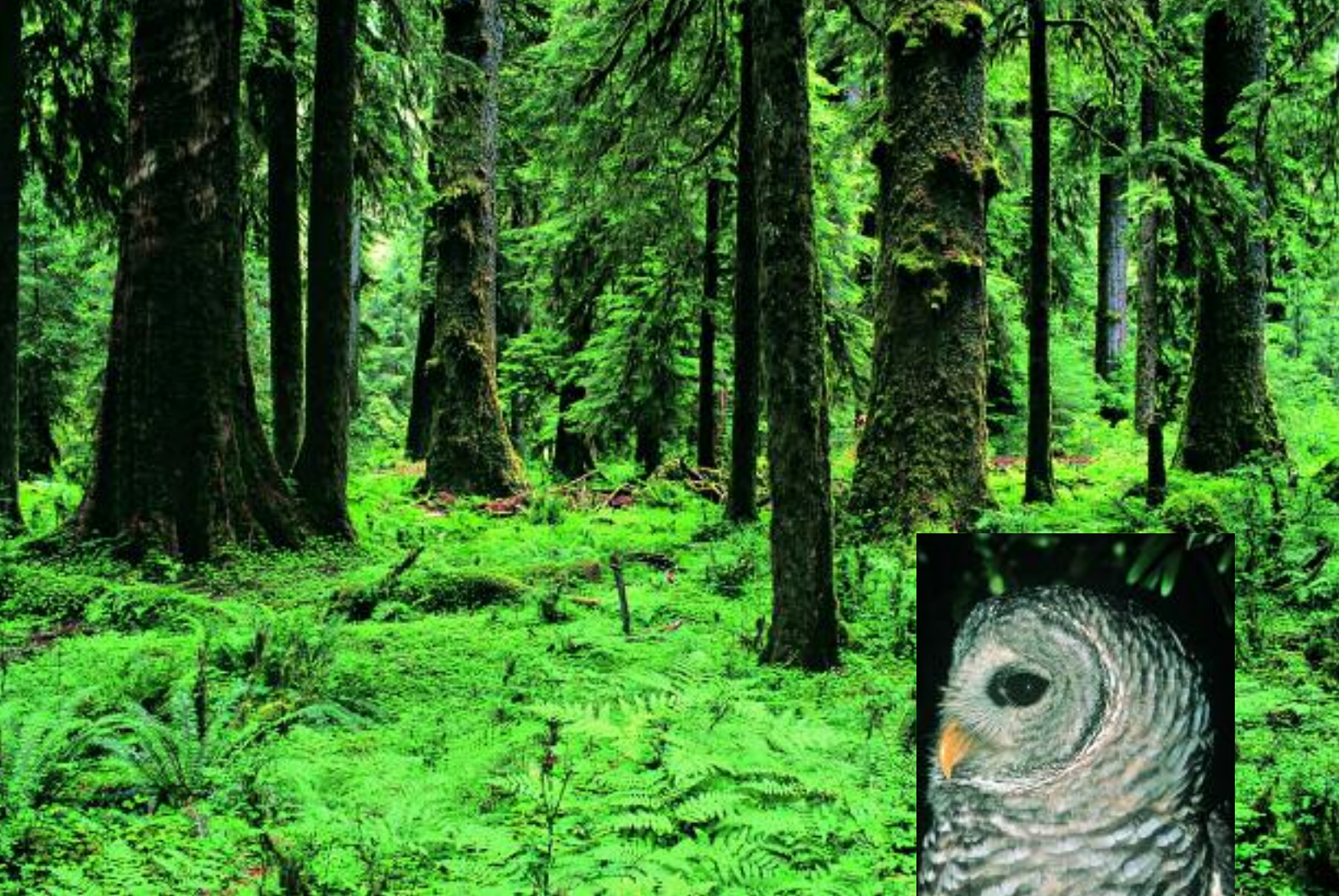
Old-growth sitka spruce, Olympic National Forest, Washington. INSET: Barred owl, the spotted owl's nemesis.

declining in areas where no harvesting has occurred.