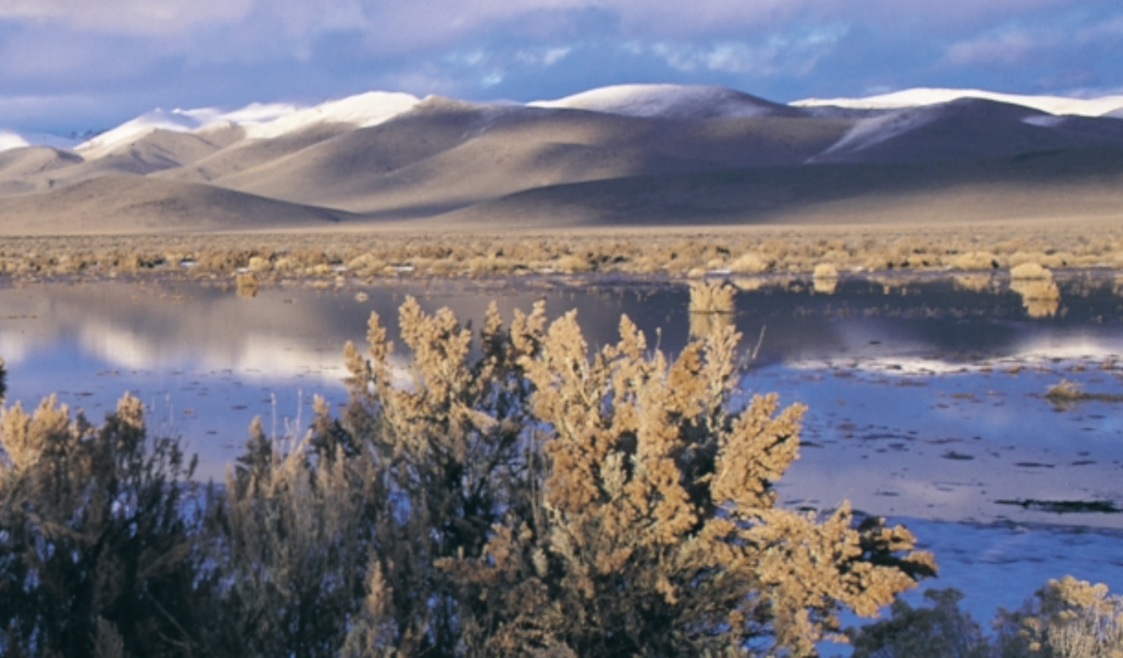
GRAZING LAND, NEVADA