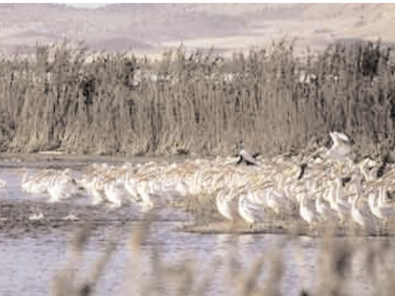
ABOVE: Pelicans on Southern Oregon's Lower Klamath National Wildlife Refuge. TOP: Tiger swallowtail. RIGHT: Mule deer fawn.

landowners later want to develop their land when the agreement expires, they can return it to the condition it was in before the improvements without penalty. At the same time, the Service can give