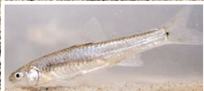
The South Canadian River winds through Oklahoma's Canadian County, giving sustenance to land and livestock. INSET: The tiny Arkansas River shiner (which may live in the river and might be endangered) threatens the livelihood of whole communities.