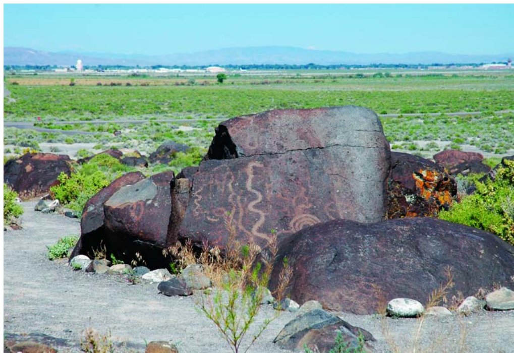
Indian petroglyphs are overshadowed by the Fallon Naval Air Station in the distance, where they train Top Gun pilots and do pretty much whatever they like. After all, the government owns almost all of Nevada.