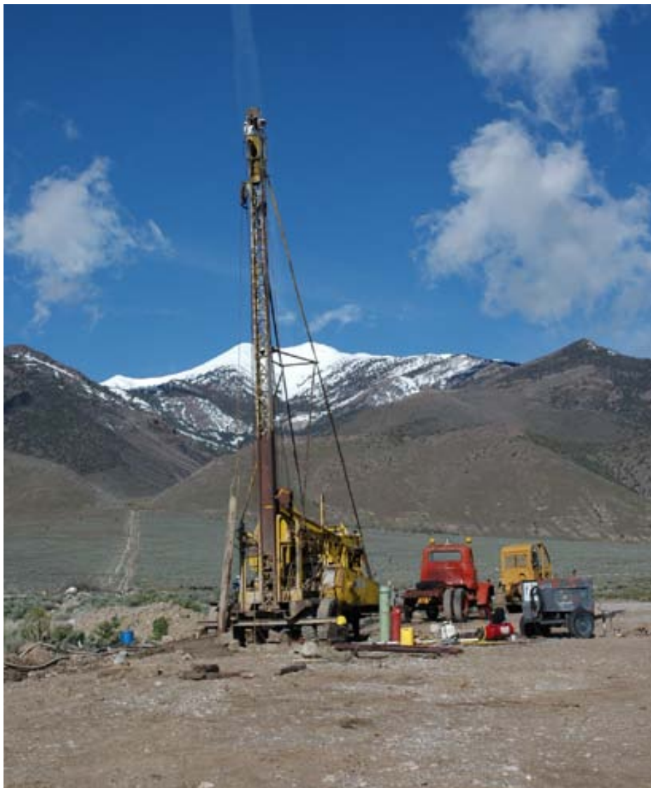
Punching a hole in the ground to reach a mythical ocean-size aquifer may just be a pipe dream, but no one knows what pumping will do to the water table. People in rural Nevada fear being left high and dry while Las Vegas waters its golf courses—thirty-